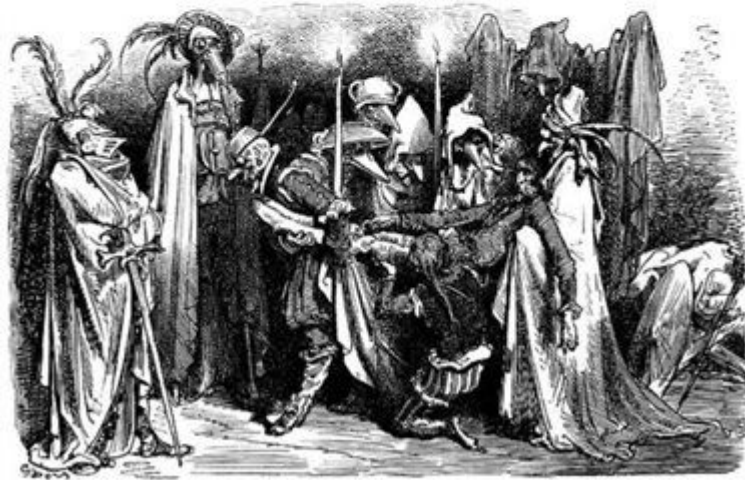
ABOVE: The brawling at the inn (l. 46). BELOW: The Don carried to his cage (l. 46).