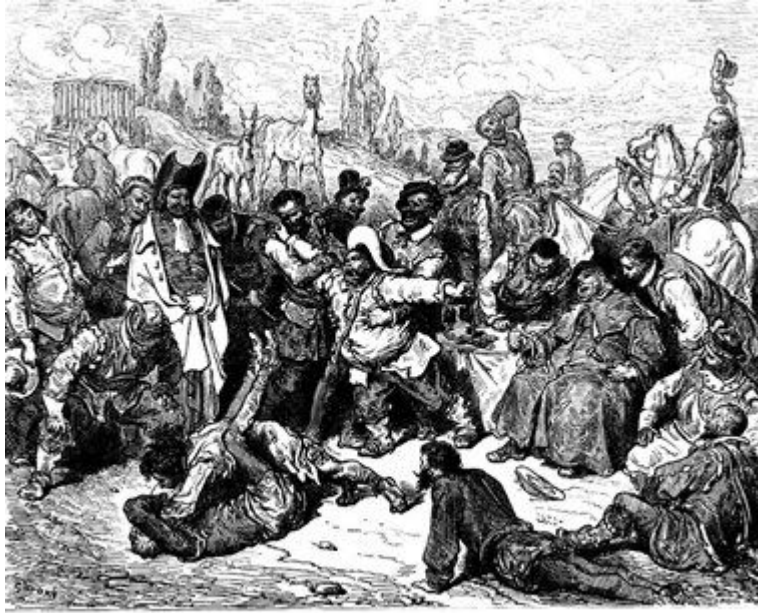
Only Sancho is alarmed when the goatherd punnels Don Quixote (II, 52).