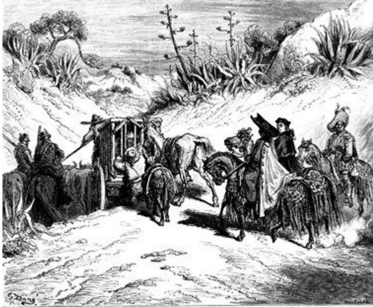
Don Quixote is brought home in a wagon (l. 47).