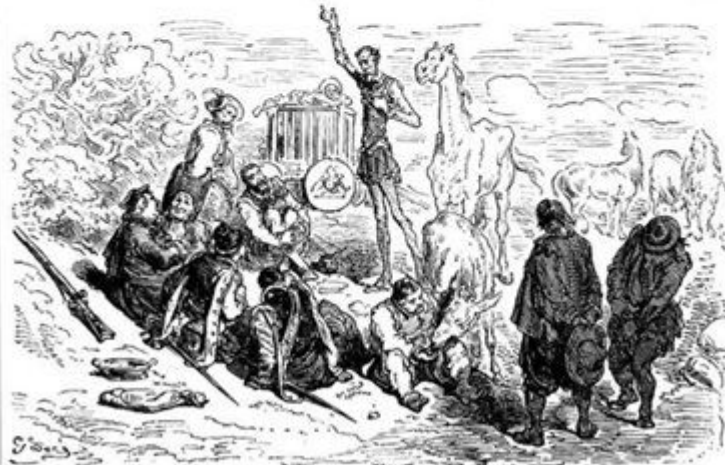
ABOVE: Don Quixote insists on the truthfulness of the knightly romances (L. 49). BELOW: A defense of the books of chivalry (L. 50).