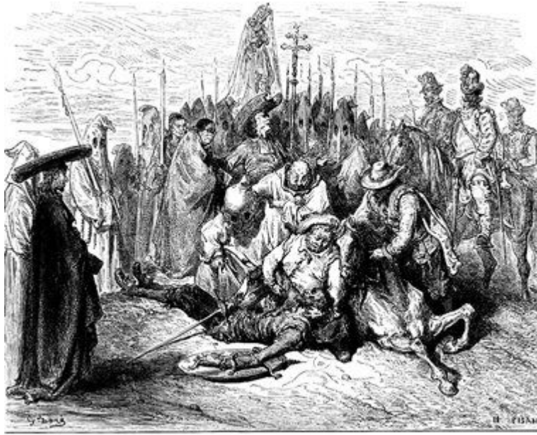
Don Quixote comes off badly in his attack on the white penitents (l. 32).