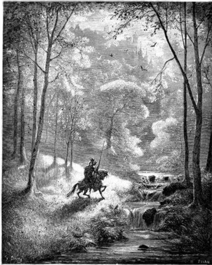
After plunging into the boiling lake, the knight finds himself in a lovely countryside (l. 50).