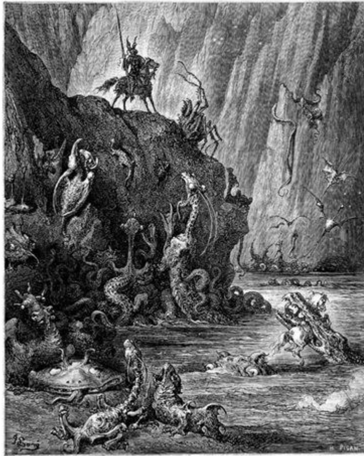
A typical scene from a romance: a knight comes to a lake of boiling pitch inhabited by gruesome monsters (l. 50).