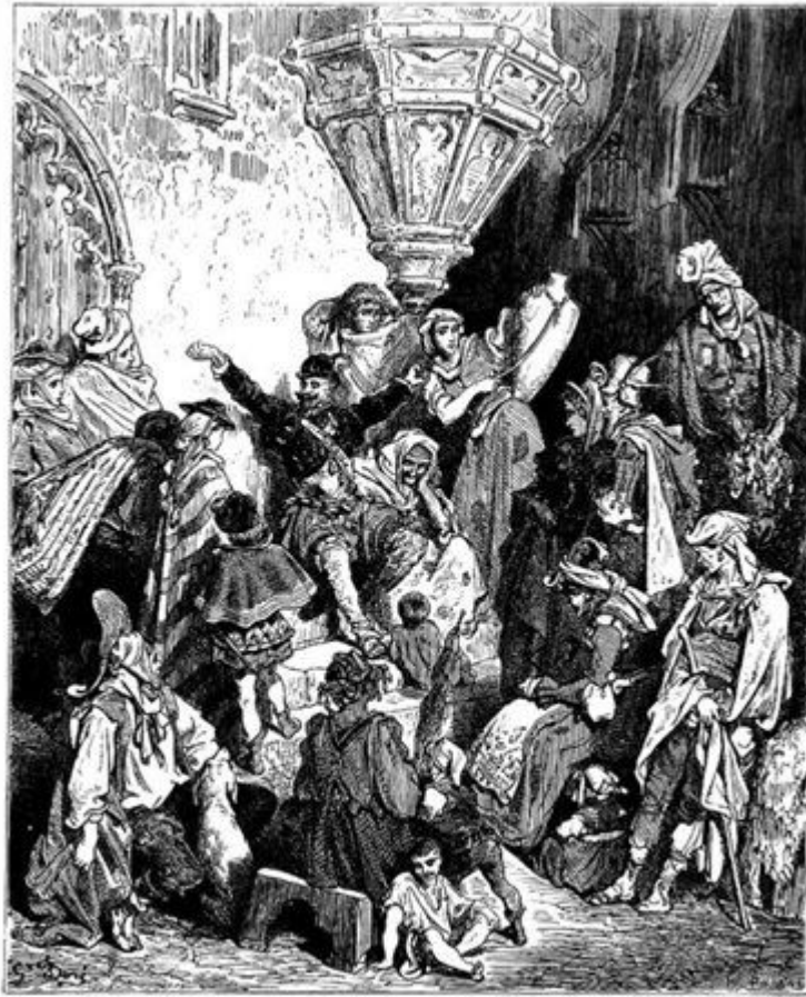
In the gaither's story, Vicente de la Roca claims to have campaigned all over the world (I, 51).